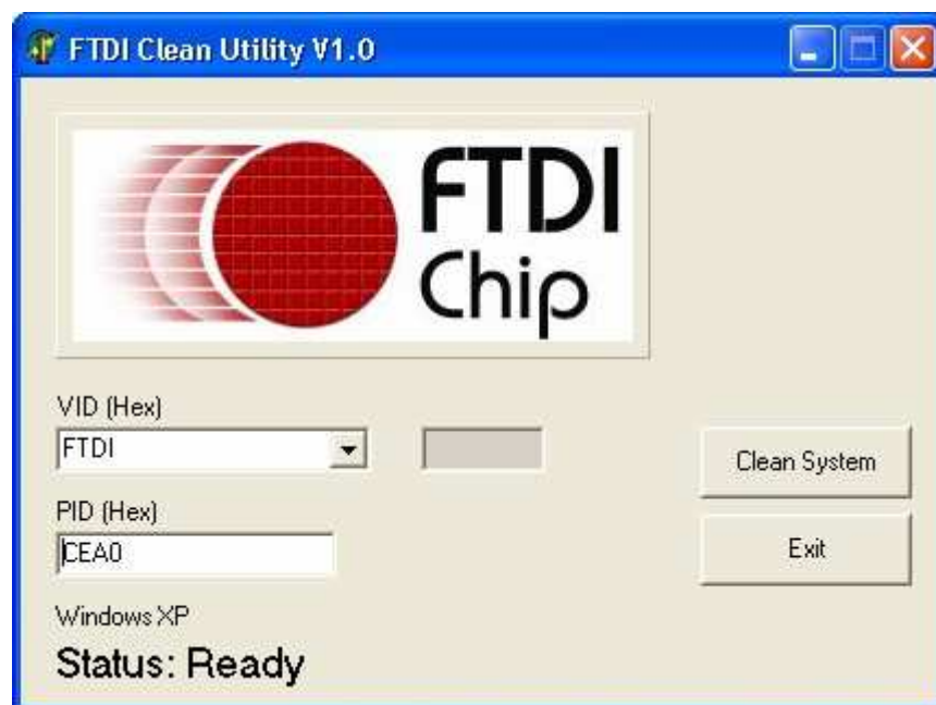
Figure 3. Complete VID and PID values