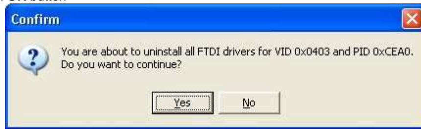
Figure 5. Confirm the driver