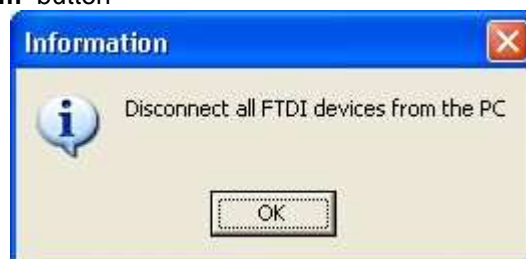
Figure 4. Disconnect all devices