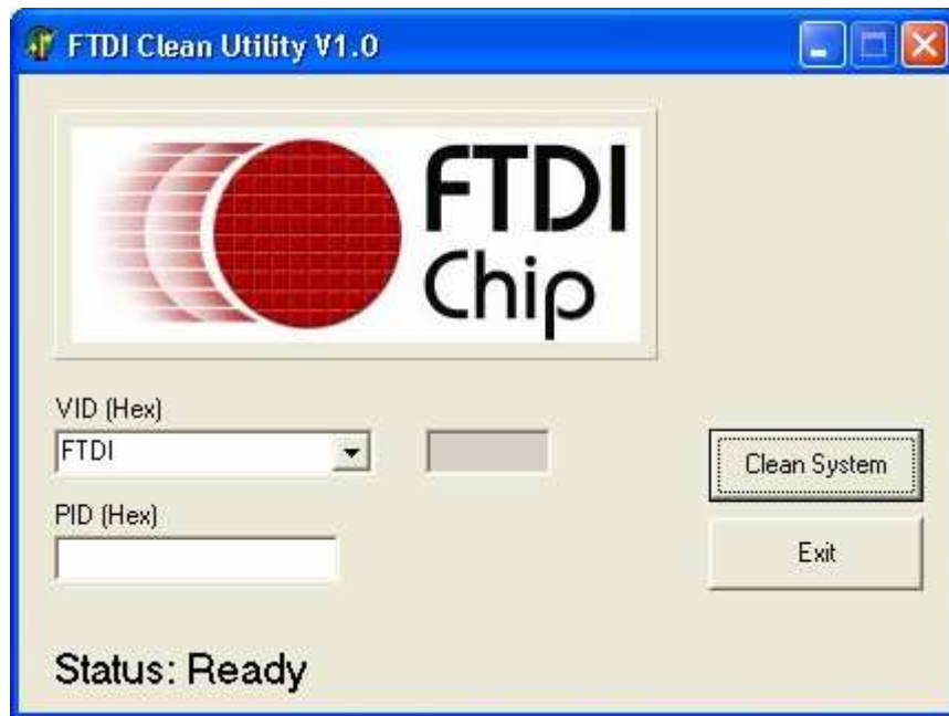
Figure 2. FTClean program